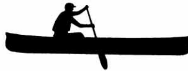
CANOE 8" - $35.00