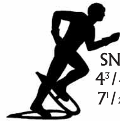
SNOWSHOE 4 3/4" - $30.00 7 1/2" - $35.00