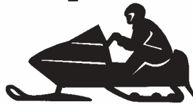
SNOWMOBILE 4 1/2" - $25.00 7" - $35.00