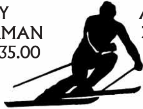
ALPINE SKIER 3 1/4" - $30.00 5" - $35.00