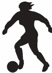
SOCCER PLAYER 7 1/2" - $35.00 M/F