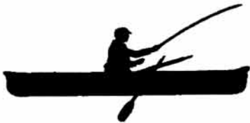
FISHING BOAT 8" - $35.00