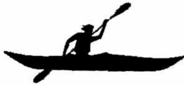
KAYAK 9" - $30.00 11" - $35.00