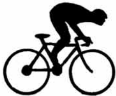
ROAD BIKE 5 1/4" - $35.00 8" - $45.00