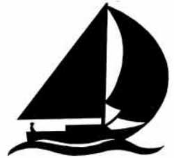
SAILBOAT 6" - $35.00 8" - $40.00